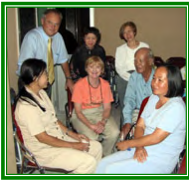
Lunch time conversation