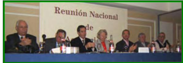
Presidents giving regional reports

In December 2005 we were invited to participate in the two-day National Congress on Ostomy held in Bilbao (Basque Region). We were happy to meet again with old friends, the association presidents who had celebrated WOD4 with us at our garden party in Jávea in 2002!