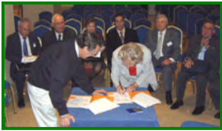
EOS signs the Manifesto

We find this development both interesting and exciting because, at WOD 4 we had invited our friends from all these corners of Spain with the express intention of beginning the move towards the formation of a national body for ostomates in Spain - and our effort has finally started to bear buds -if not yet fruit! I think we can now assume that there will be Federation in place - possibly by the end of this year. There will be another meeting called when the promoters are ready and if EOS is able to attend this, we will keep you advised as things develop.