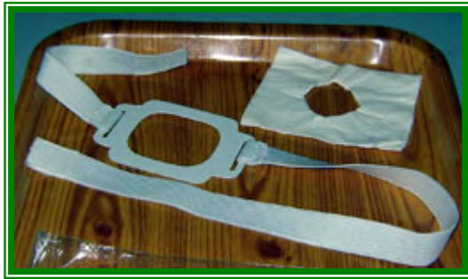
Improved Ostomy appliance