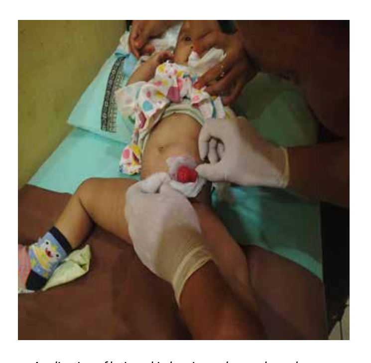
Application of lotion skin barrier and rope-shaped gauze

To protect the peristomal skin, the skin barrier was applied. In addition to that, a rope-shaped gauze was put circumferentially around the stoma tightly but not too tight to absorb stoma effluent. The plastic bag was then placed to cover the stoma and peristomal area. A proper plastic bag placement will put the gauze inside the bag and the bag is in contact with peristomal skin. Finally, the palstic bags's aperture is sealed using a non allergenic tape in a medial-upward position.