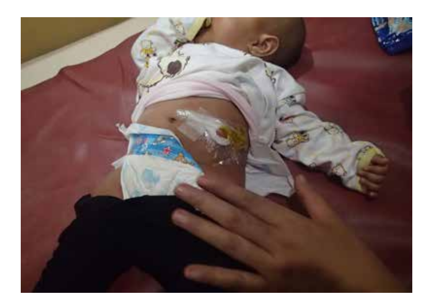
Final bag placement

Since gauze is unable to provide long term protection to the peristomal skin, the mother was then told to replace the plastic bag, cleanse peristomal skin, and dry it up everytime the effluent reaches 25% of the bag volume.