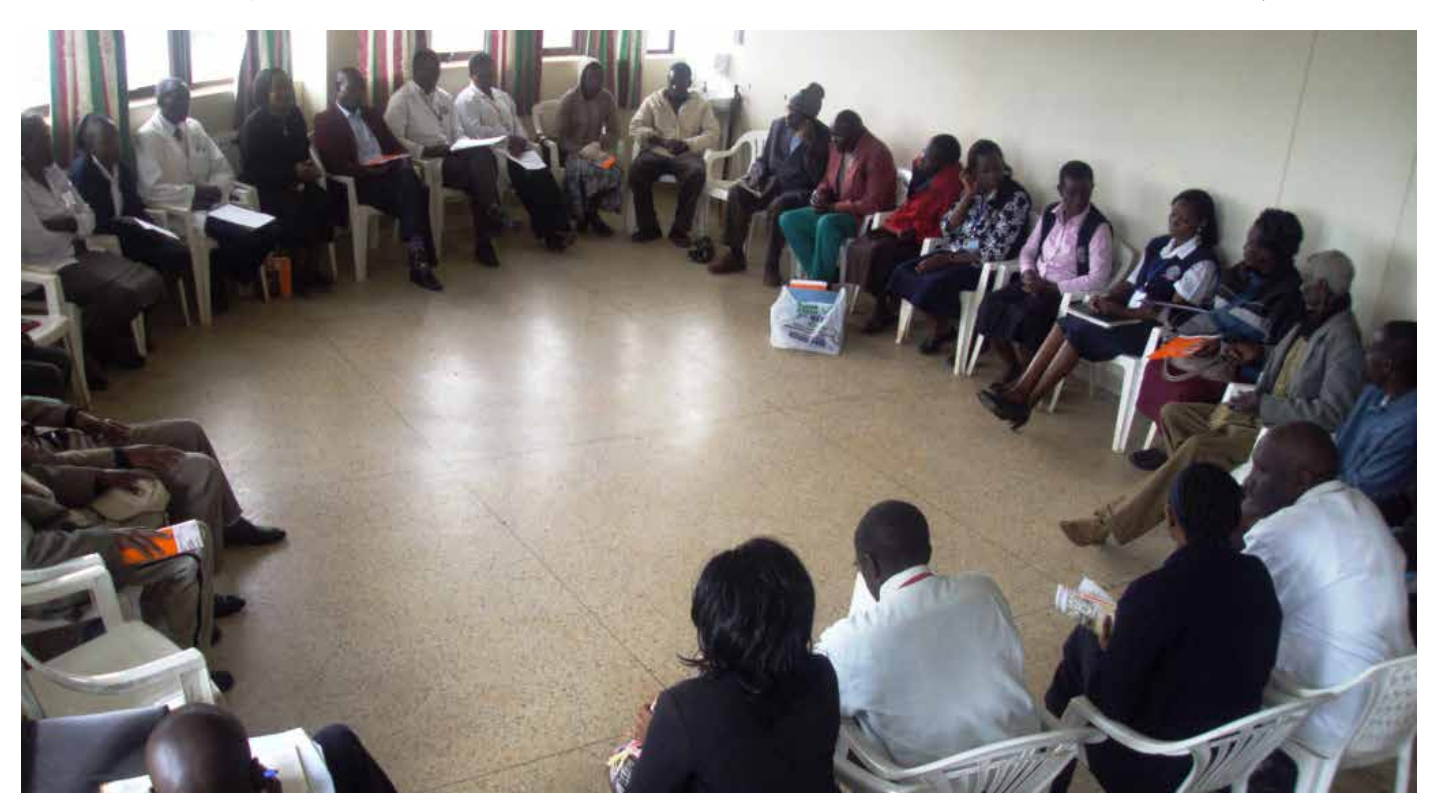
Ostomates and staff members in a support group meeting

A Colo-rectal cancer survivor's support group meeting was held and attended by 15 survivors. A colorectal cancer survivor's support group was formed and elections held. The first stoma clinic was started the same day.