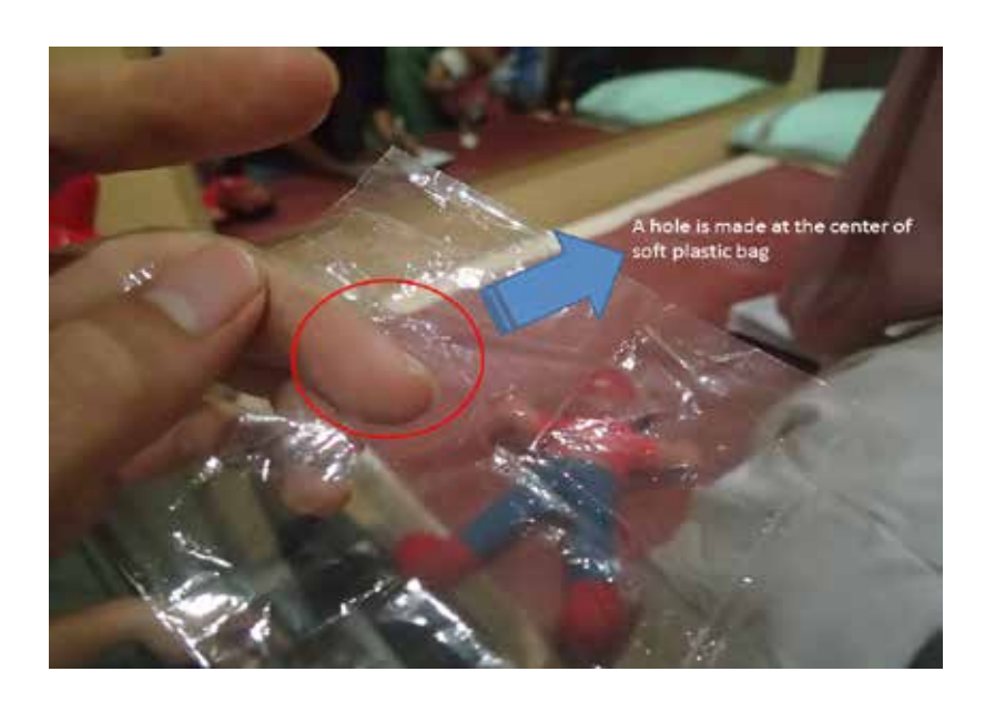
Customised plastic bags

To protect the peristomal skin, the skin barrier was applied. In addition to that, a rope-shaped gauze was put circumferentially around the stoma tightly but not too tight to absorb stoma effluent. The plastic bag was then placed to cover the stoma and peristomal area. A proper plastic bag placement will put the gauze inside the bag and the bag is in contact with peristomal skin. Finally, the palstic bags's aperture is sealed using a non allergenic tape in a medial-upward position.