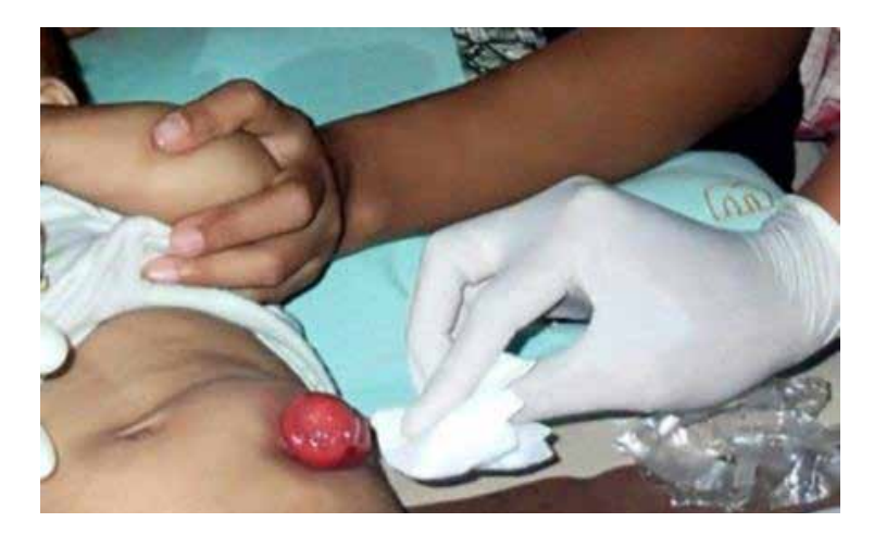
Significantly reduced peristomal skin irritation

In terms of cost effectiveness, the mother stated that this method is really helps her to save money. All the materials are very cheap, and the lotion skin barrier were provided with a very cheap price by WOCARE clinic, supported by the SOS (StomaNurse Ostomate SupportGroup).