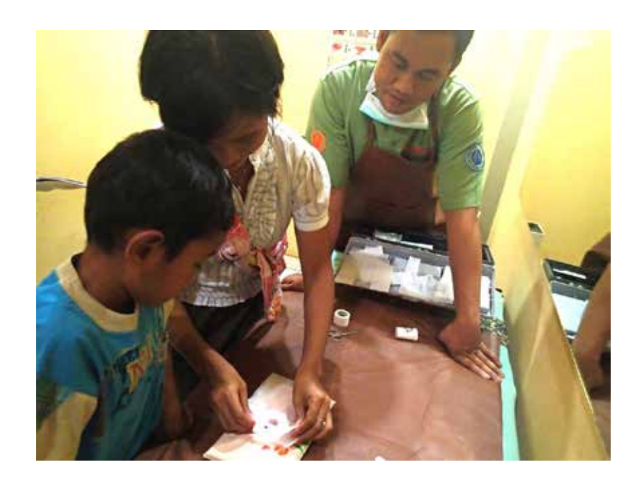
Mother and sibling were actively involved to promote independency and confidence when treating the baby