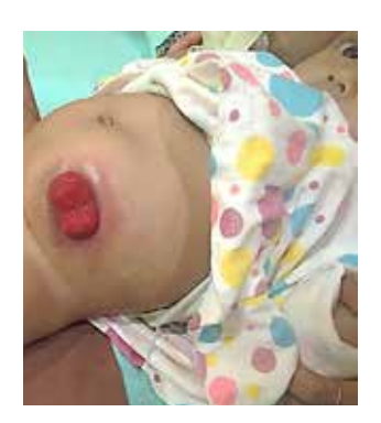
Peristomal skin irritation

After ten days, client came to the clinic for another check up and consultation. The mother said that the one piece bag was not appropriately fit to her baby. She was continuously grab and pull the ostomy bag so that the bag was taken away inadvertently. As a solution, the mother used a hand made double-taped plastic bag to replace the stoma bag. After several days a peristomal skin irritation was occurred, and appeared as a reddened and stretched area around the stoma.