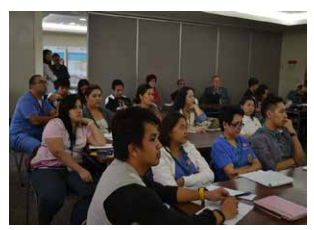
Lecture at The Medical City Conference Room