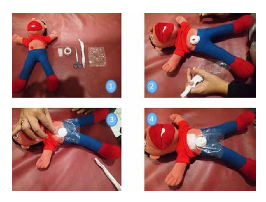
Patient Learning aids

To promote parent's active involvement in stoma care, the mother was then taught the technique used to prepare such ostomy bag. Using an ostomy puppet, the mother, along with the ostomy nurse re-perform the procedure from materials preparation until ostomy bag fixation.